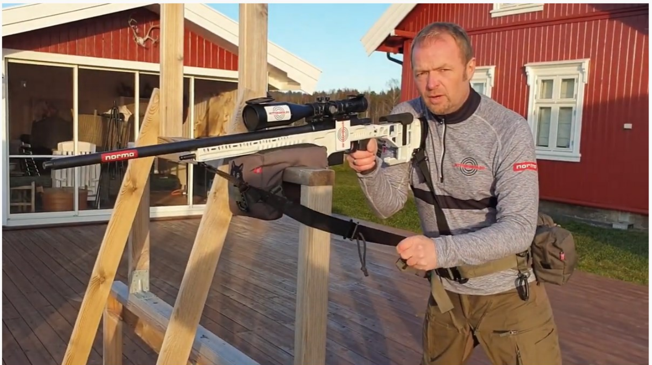
PRS for Dummies Part 3 - Improve your stability with a sling

Look us up and follow us on social media! "Ulfhednar Shooting"